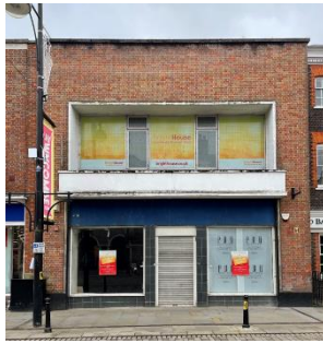
37 High St: Before