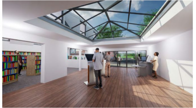
Wendover Library design concept