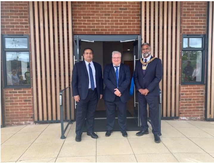
Opening Penn Road Cemetery

Work continues on the £2.3 million capital improvement programme (funded from crematoria reserves) to replace the 3 aging cremators at Chilterns Crematorium in Amersham, with construction activity due to continue until March 2023. Two of the three cremators have now been replaced and are operational, with the final cremator due to be installed by the beginning of November 2022. All works are being carried out on the site alongside our normal Service activity with any potential impacts to our customers carefully managed and mitigated. As part of the project works additional abatement plant for nitrogen oxide will be installed which is over and above current statutory requirements, supporting the Councils key priority to improve the environment and tackle climate change.