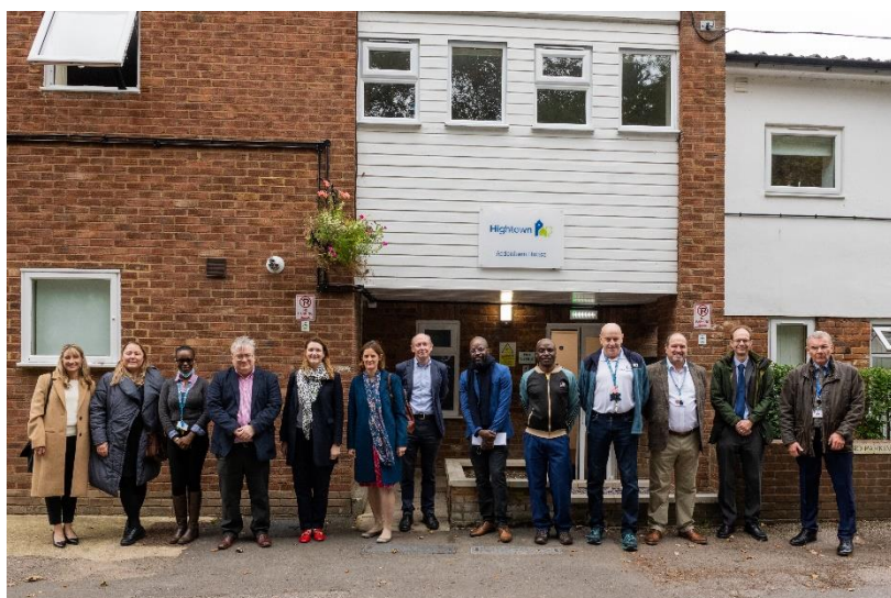
Opening Ardenham House move on accommodation for former rough sleepers

The Council continues working with its partners in the statutory and voluntary sectors (including the Council-funded Rough Sleeper Outreach service operated by Connection Support) to engage with rough sleepers and, where possible, move them off the streets and into accommodation.