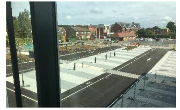
Chiltern Lifestyle Centre car park

landscaping and external play areas being delivered with phase 1 of the car parking open