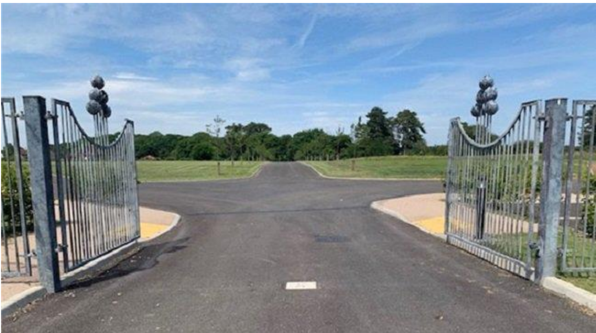
Penn Road Cemetery

Work continues on the £2.3 million capital improvement programme (funded from crematoria reserves) to replace the 3 aging cremators at Chilterns Crematorium in Amersham, with construction activity due to continue until March 2023. Two of the three cremators have now been replaced and are operational, with the final cremator due to be installed by the beginning of November 2022. All works are being carried out on the site alongside our normal Service activity with any potential impacts to our customers carefully managed and mitigated. As part of the project works additional abatement plant for nitrogen oxide will be installed which is over and above current statutory requirements, supporting the Councils key priority to improve the environment and tackle climate change.